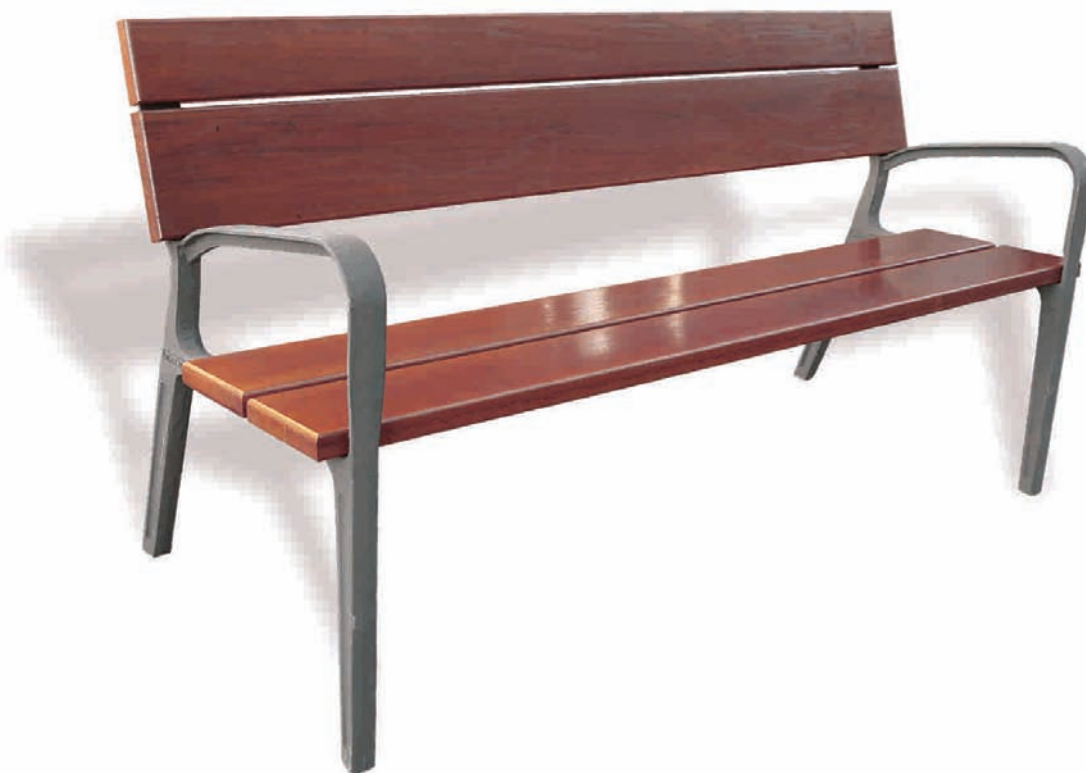
Designed by: Joaquim Carandell, 2004 © Fundicio Ductil Benito